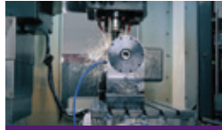
MANUFACTURING & TESTING