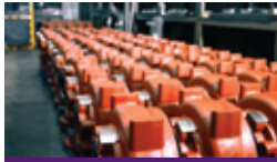
SUPPLY CHAIN MANAGEMENT