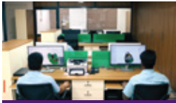
DESIGN & ENGINEERING